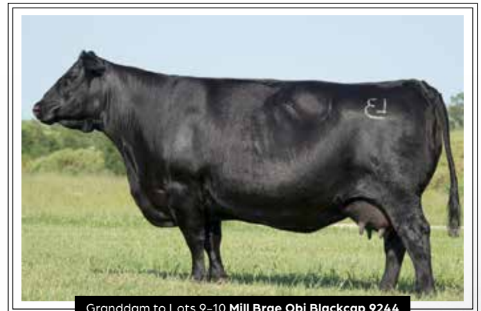
Granddam to Lots 9-10 Mill Brae Obj Blackcap 9244