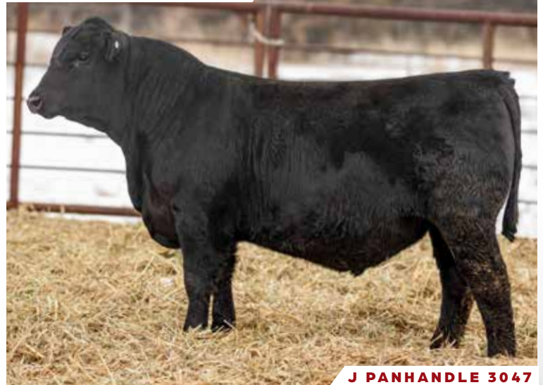
J PANHANDLE 3047