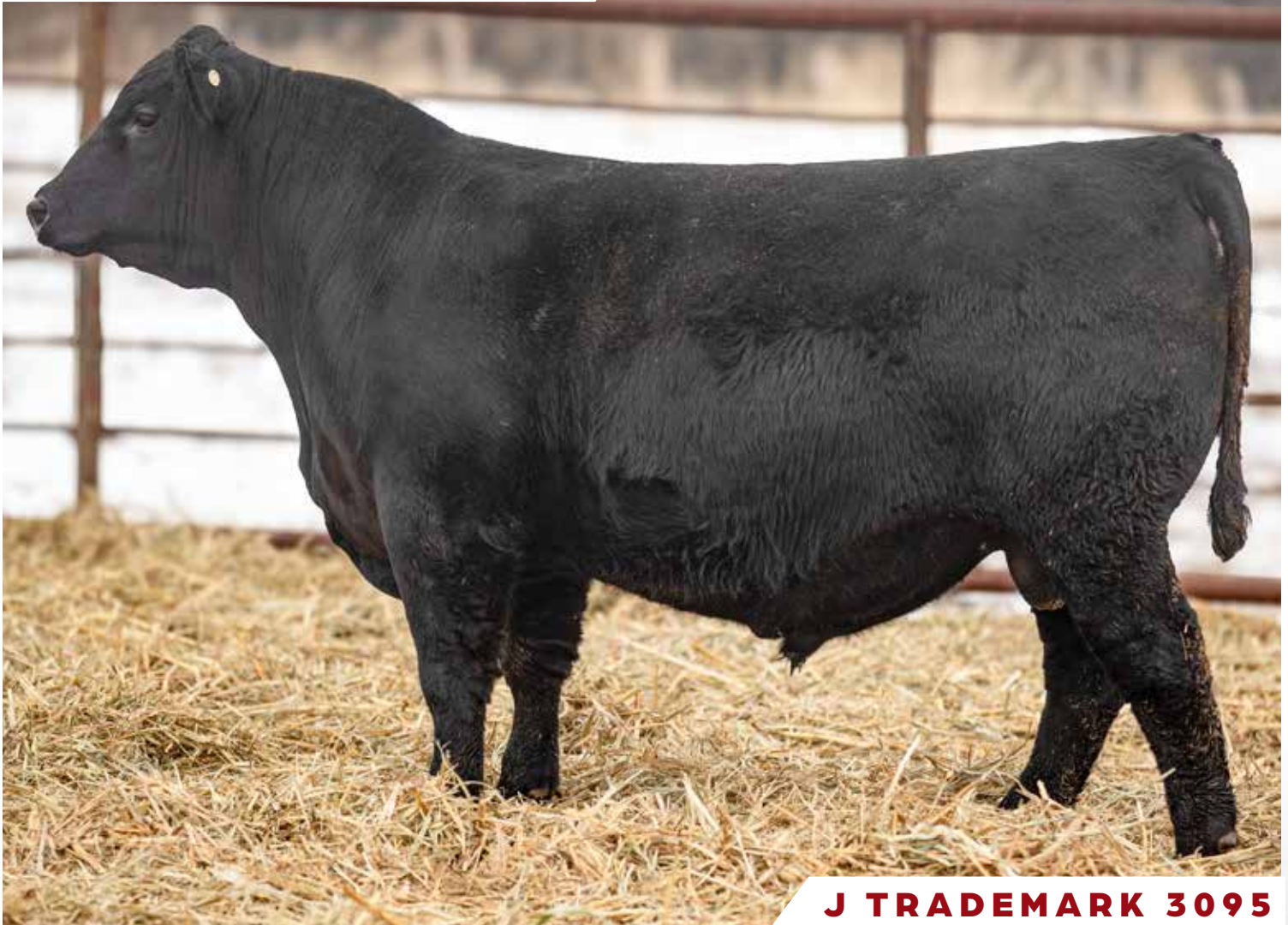
J TRADEMARK 3095