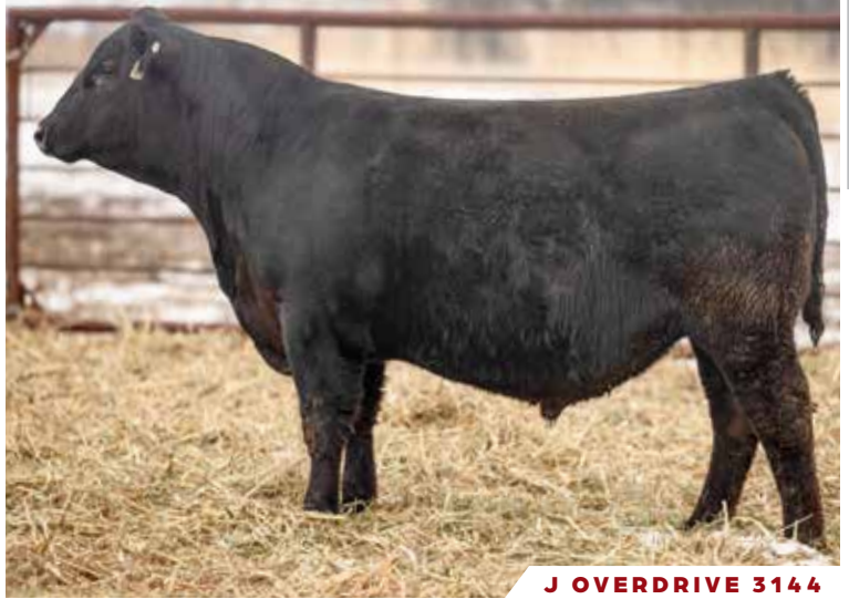
J OVERDRIVE 3144