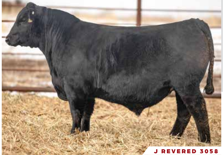
J REVERED 3058