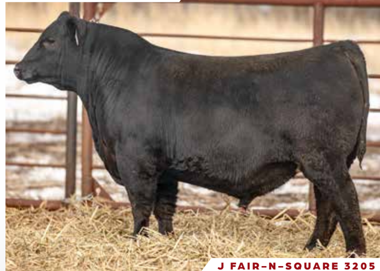
J FAIR-N-SQUARE 3205