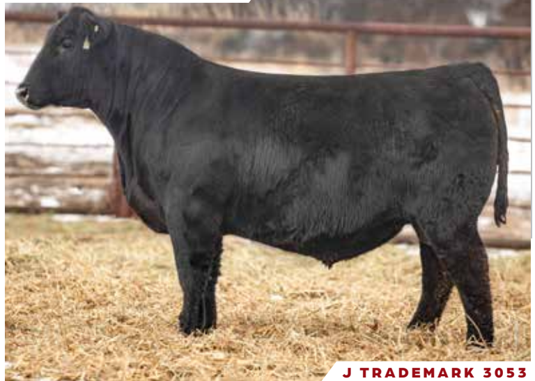
J TRADEMARK 3053

Lot 9 & 10 are full brothers in blood back to our 9244 donor. Heifer bulls with added length and frame to not sacrifice pounds or maternal merit.