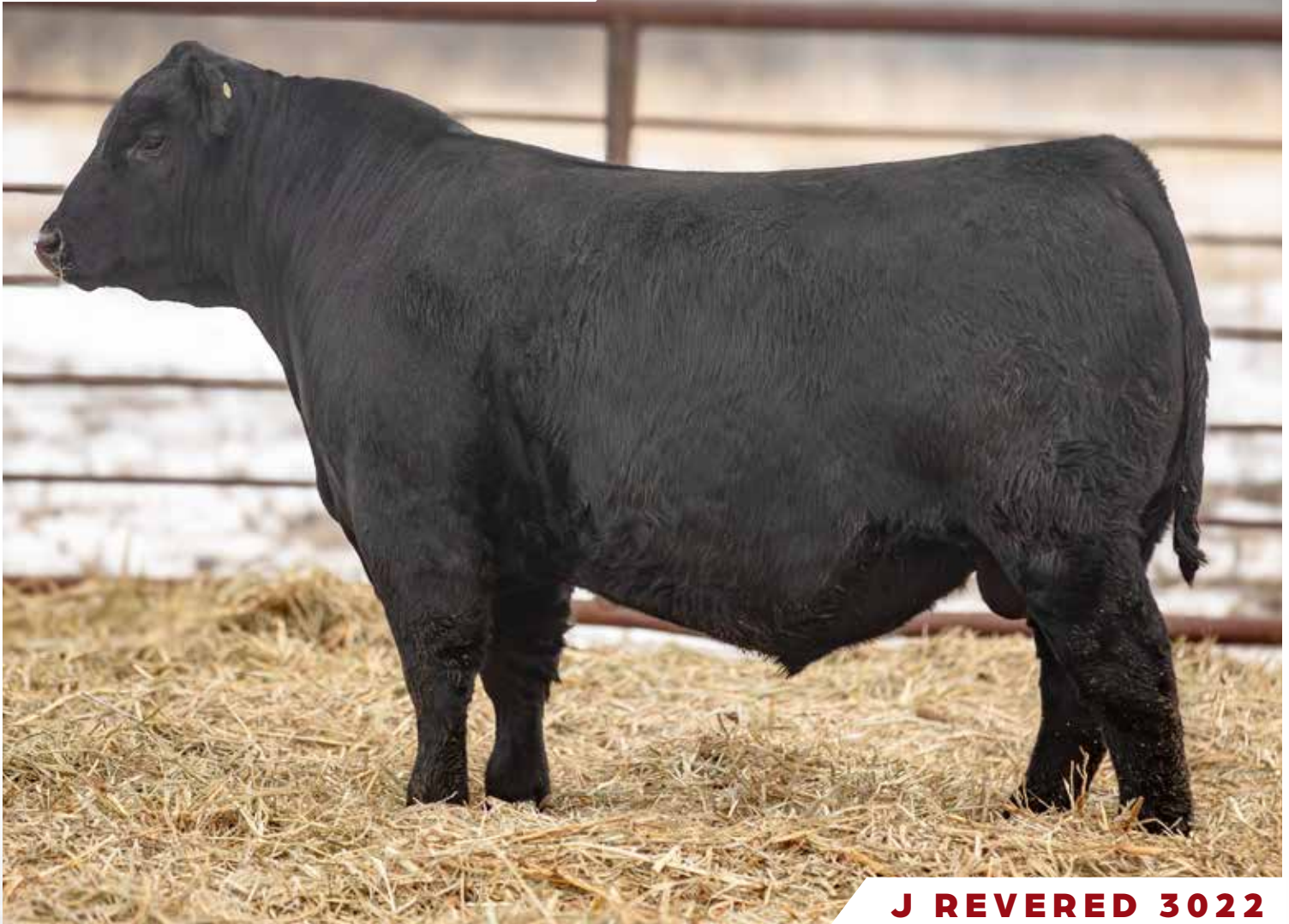
J REVERED 3022