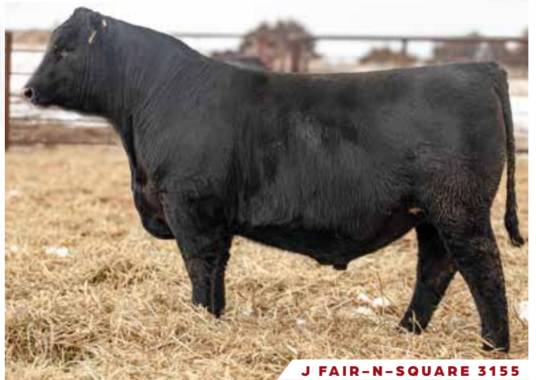
J FAIR-N-SQUARE 3155