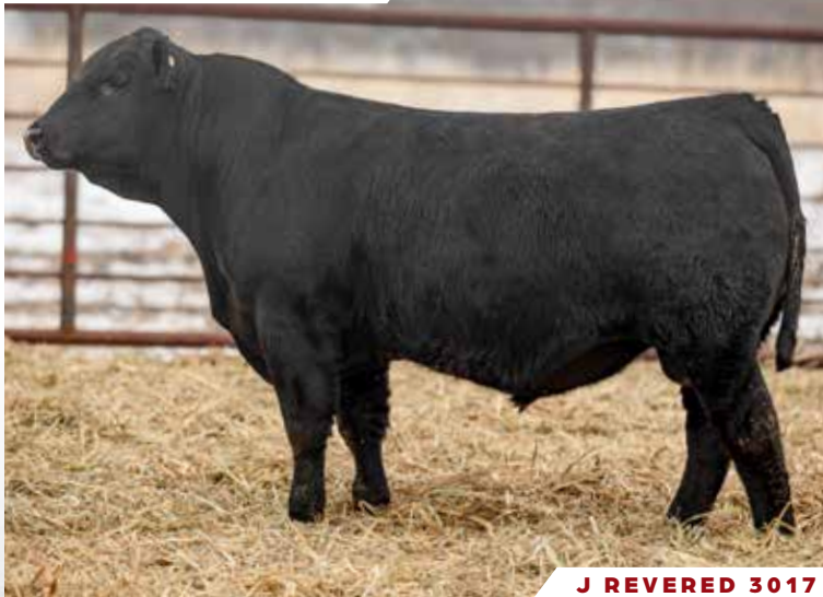
J REVERED 3017