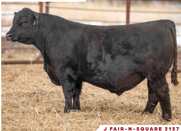
J FAIR-N-SQUARE 3157