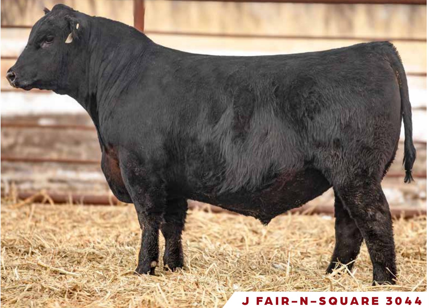
J FAIR-N-SQUARE 3044