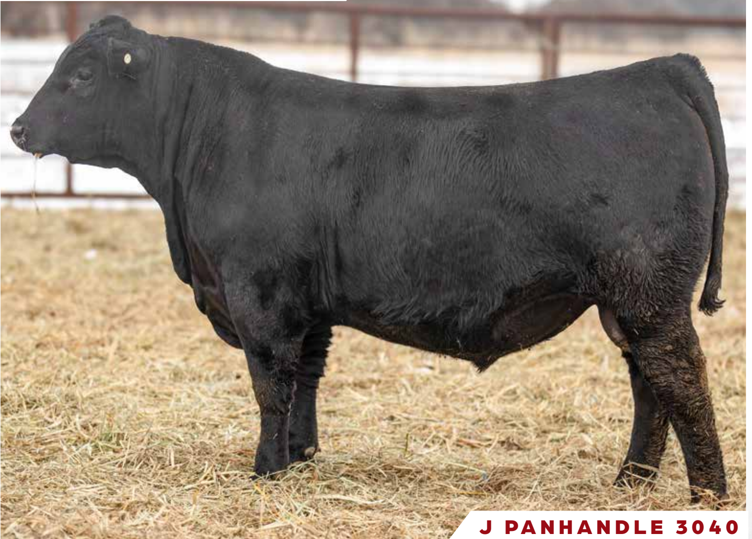
J PANHANDLE 3040