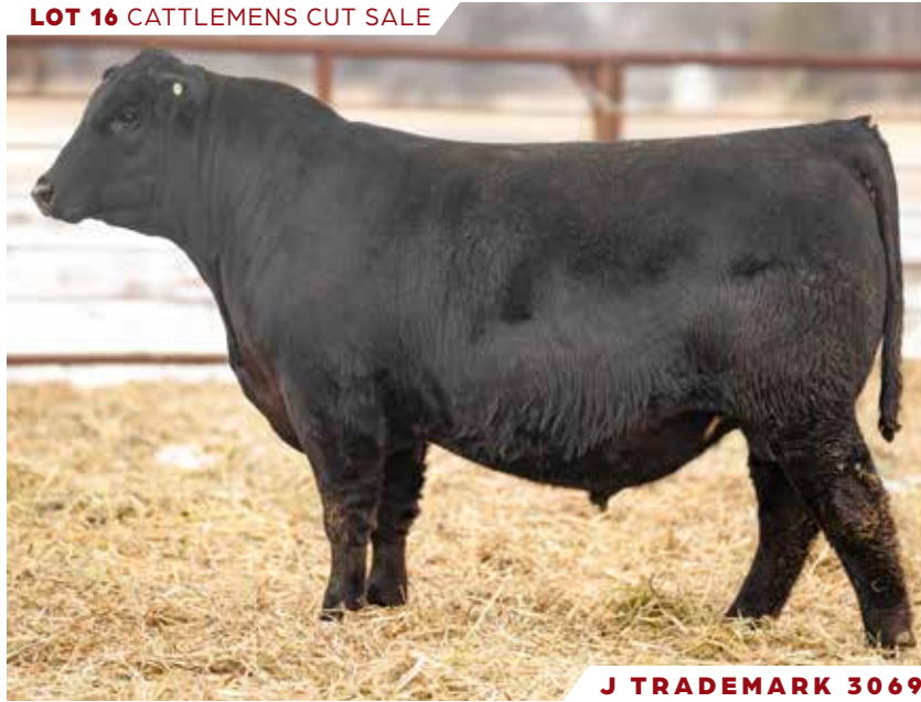
J TRADEMARK 3069