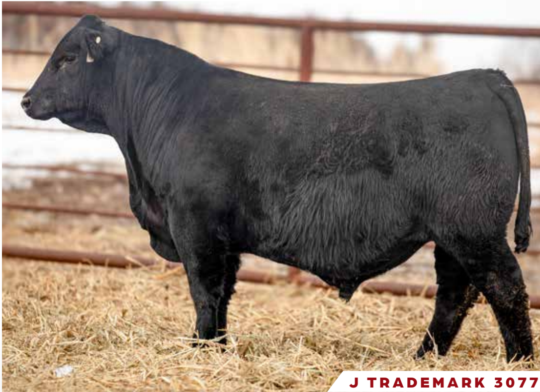
J TRADEMARK 3077