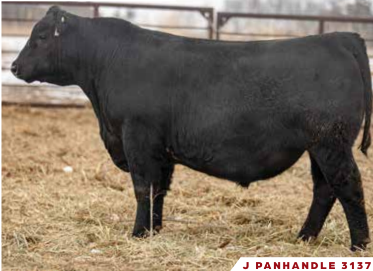
J PANHANDLE 3137