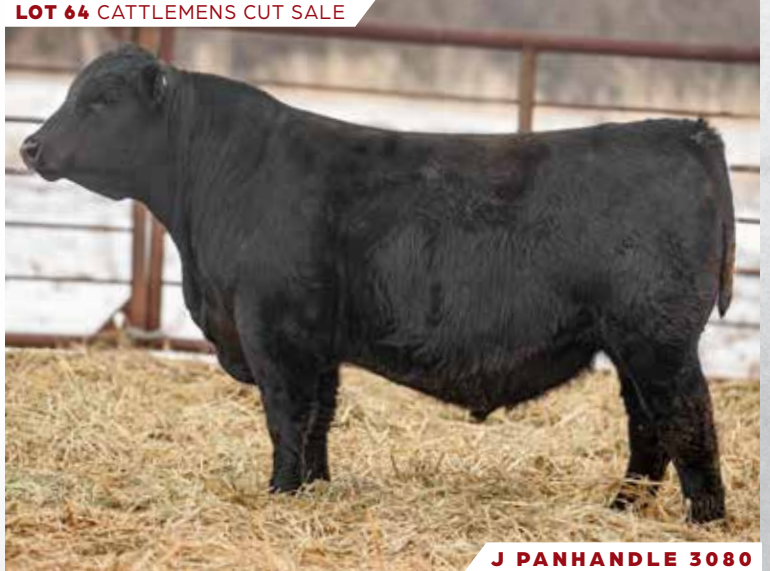
J PANHANDLE 3080