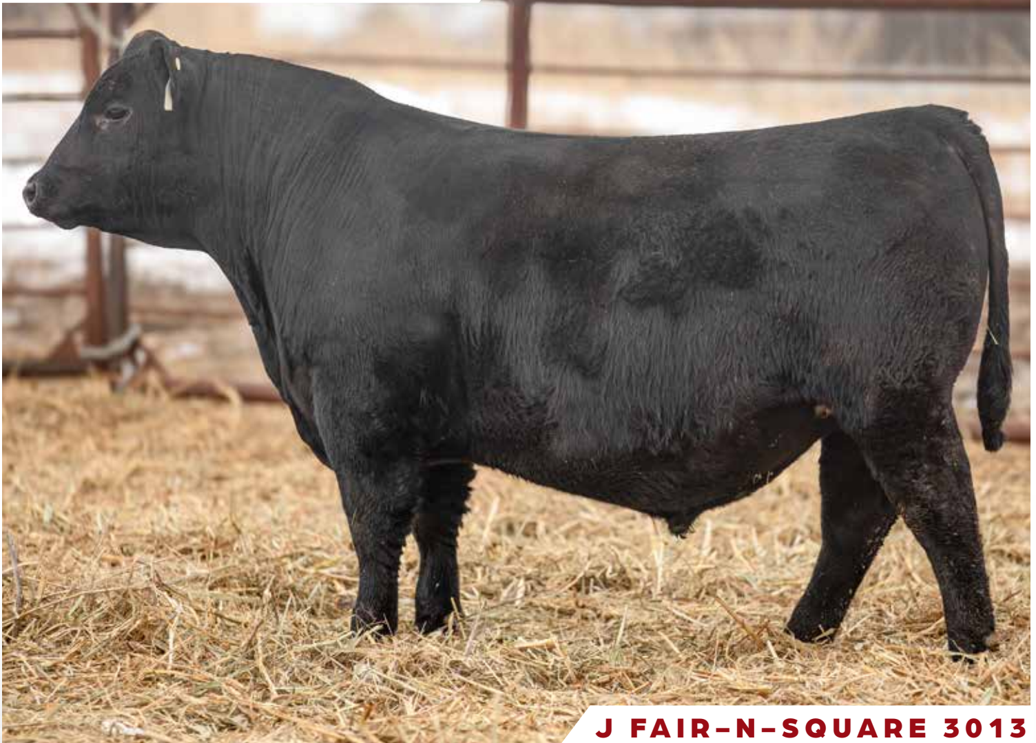
J FAIR-N-SQUARE 3013