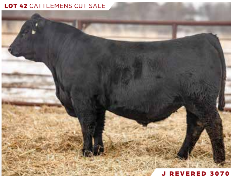
J REVERED 3070