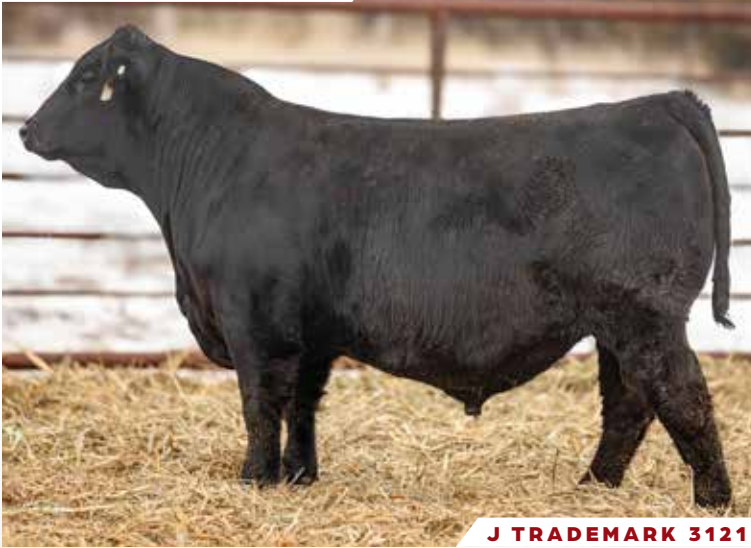
J TRADEMARK 3121