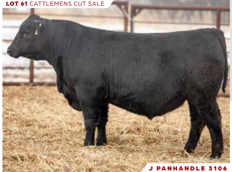
J PANHANDLE 3106