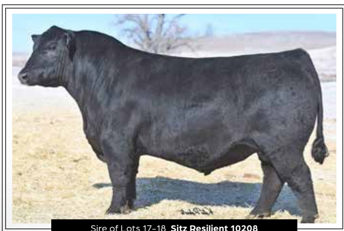
Sire of Lots 17-18 Sitz Resilient 10208

flush brothers LOTS 17-18 The last full sibs to J Trademark. Great in their type and kind. The full sisters are looking great with their first calf.