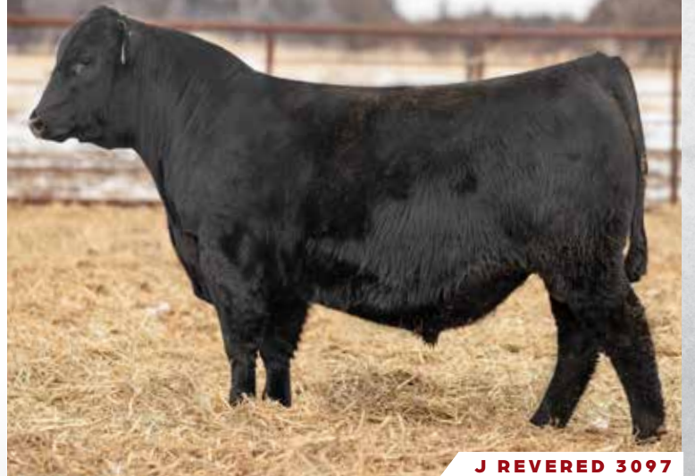
J REVERED 3097