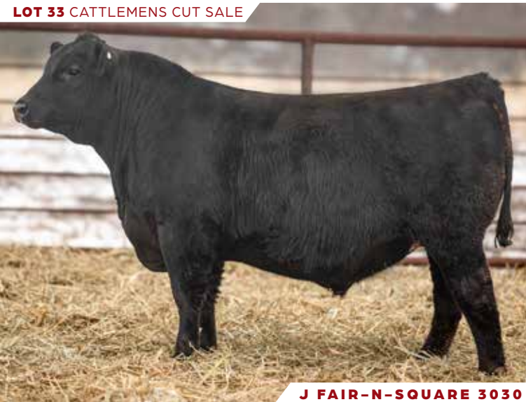
LOT 33 CATTLEMENS CUT SALE