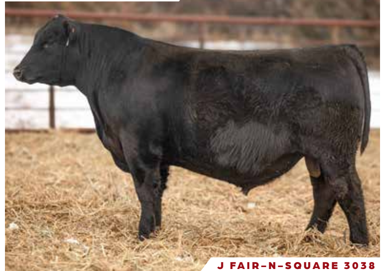
J FAIR-N-SQUARE 3038