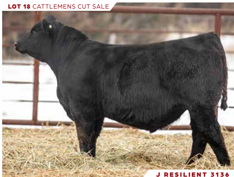
J RESILIENT 3136